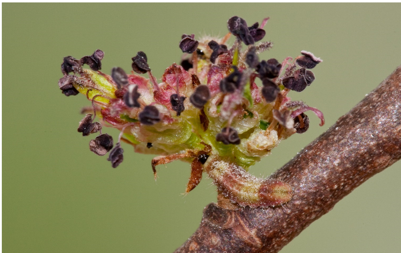
Figure 2. White-letter Hairstreak larva on elm flower.

NB. The French natural history unit VarWild has produced a 14 minute film of the lifecycle of the WLH, with close-up photography: https://www.youtube.com/watch?v=vdDNGF2HDr0