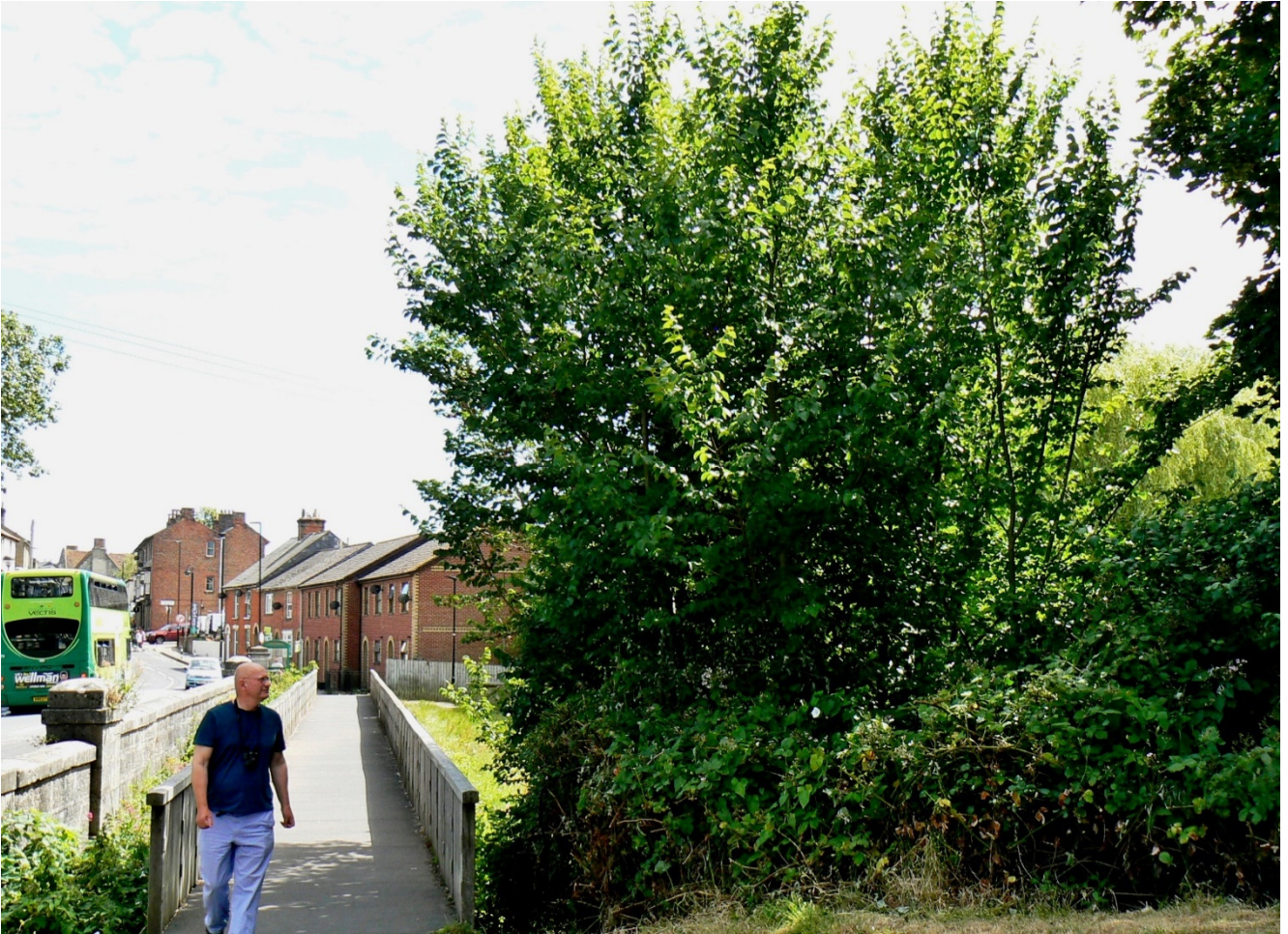
Figure 1. LUTECE elm, Newport, IoW, hosting the WLH in 2015